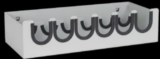
Hand Gun Pac 6 & 8 capacity