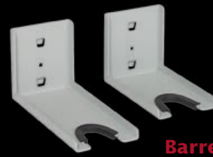
Barrel Saddle 1, 5, & 6 capacity 5.5" or 7.0" deep