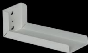
Stock Shelf 1, 5 & 6 capacity