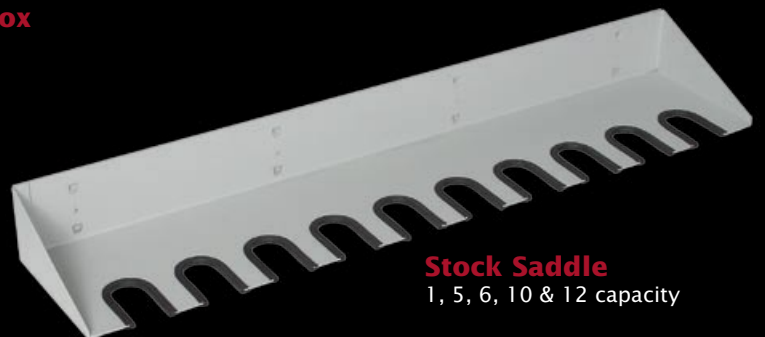
Stock Saddle 1, 5, 6, 10 & 12 capacity