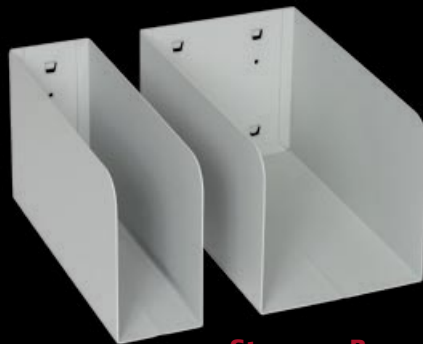
Storage Box 3" & 6"