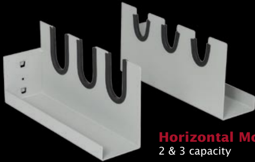
Horizontal Mount 2 & 3 capacity

No other small arms cabinet or rack compares to the extreme versatility and flexibility of our unique weapon storage systems. Combine the extensive components and the 'universal gun panel' to achieve your own custom solution.